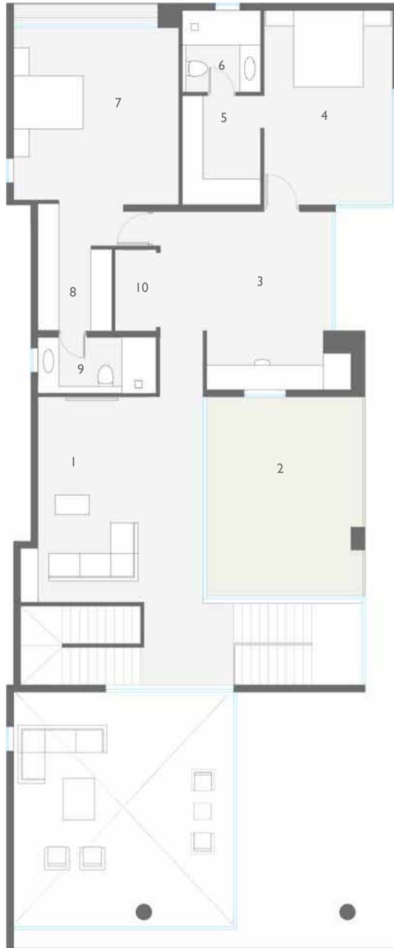
Level 17 Duplex upper level